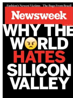
( http://europe.newsweek.com/2016/06/17/europe-newsweek-2016-06-17/ ) June 17, 2016 ( http://europe.newsweek.com/2016/06/17/europe-newsweek-2016-06-17/ )

Sadiq Khan: Remaining in Europe is the Way to be True to British values ( http://europe.newsweek.com/sadiq-khan-mayor-london-britain-stronger-eu-brex-470343 ) The Clintons: Two Presidents, One White House and a World of Trouble ( http://europe.newsweek.com/bill-hillary-clinton-election-2016-470864 )