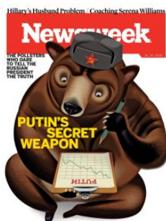
( http://europe.newsweek.com/2016/07/01/europe-newsweek-2016-07-01/ ) July 01, 2016 ( http://europe.newsweek.com/2016/07/01/europe-newsweek-2016-07-01/ )

privacy ( http://europe.newsweek.com/privacy-policy ) terms ( http://europe.newsweek.com/terms-service )