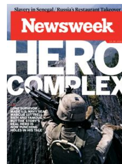
( http://europe.newsweek.com/2016/06/10/europe-newsweek-2016-06-10/ ) June 10, 2016 ( http://europe.newsweek.com/2016/06/10/europe-newsweek-2016-06-10/ )

Why the World Hates Silicon Valley ( http://europe.newsweek.com/silicon-valley-takeover-468182 ) Why Russia Still Longs for a Tsar ( http://europe.newsweek.com/second-hand-or-operation-svetlana-alexievich-soviet-union-tsar-467936 )