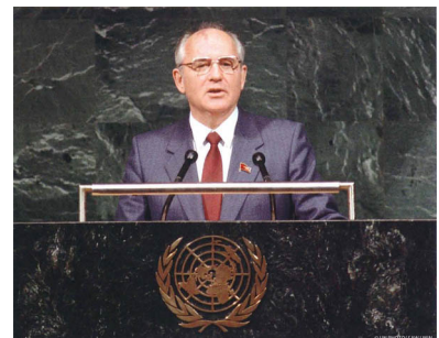
Mikhail Gorbachev addressing the forty-third session of the General Assembly of the United Nations, 7 December 1988.

For the first time in many years, members of the Security Council were able to reach a consensus and agree on concerted effective actions, which allowed them to counter the aggression of the Iraqi regime against Kuwait. The United Nations was actively involved in settling other regional conflicts, and even the persistent confrontation in the Middle East no longer seemed insoluble. The international community and its universal Organization could now turn their attention to such global challenges as the environmental crisis, poverty and underdevelopment. The survival of hundreds of millions of people and of mankind itself depends upon finding solutions to these problems.