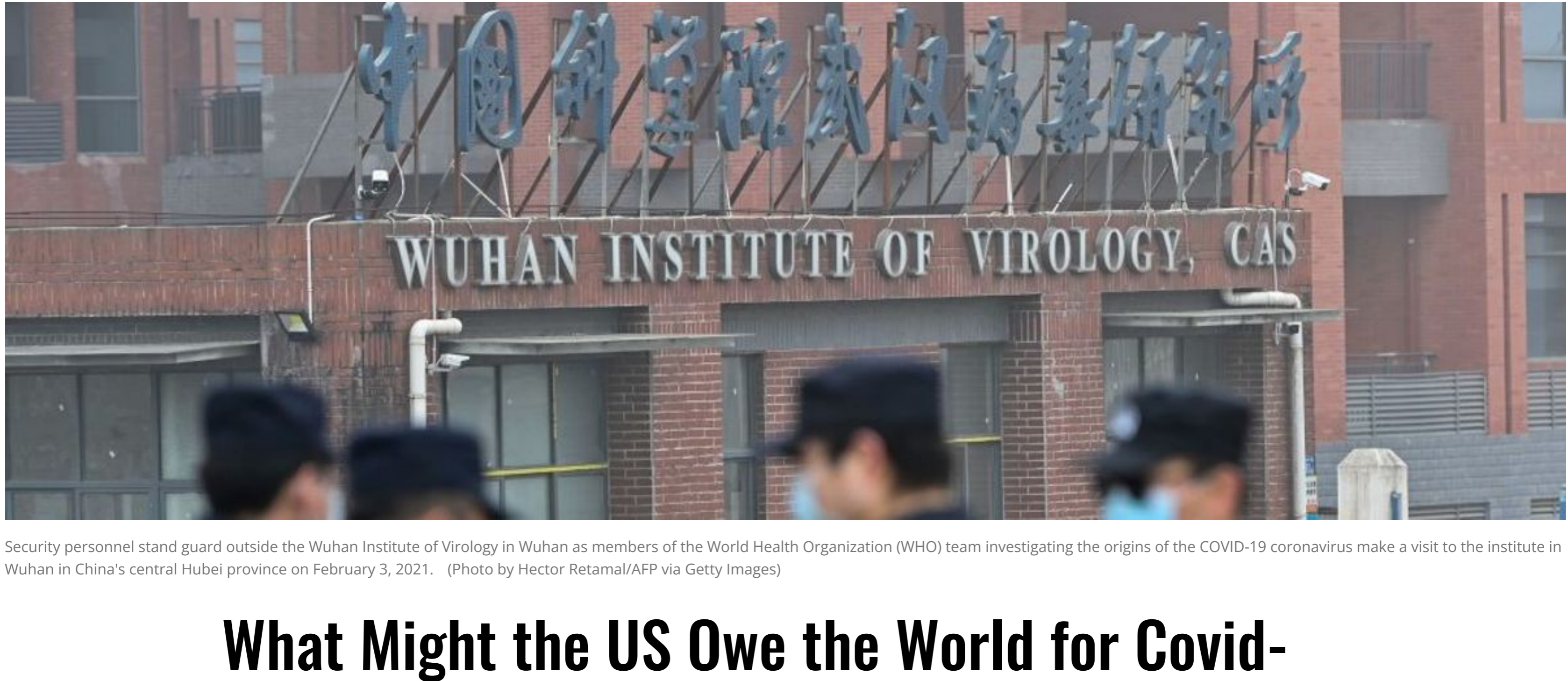
Security personnel stand guard outside the Wuhan Institute of Virology in Wuhan as members of the World Health Organization (WHO) team investigating the origins of the COVID-19 coronavirus make a visit to the institute in Wuhan in China's central Hubei province on February 3, 2021.