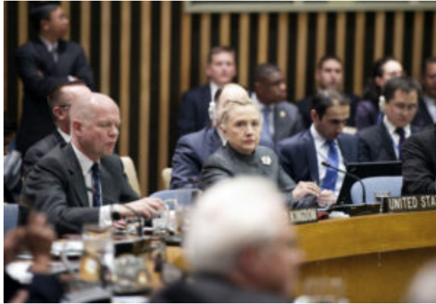
U.S. Secretary of State Hillary Clinton delivers remarks at a United Nations Security Council Session on the situation in Syria at the United Nations in New York on Jan. 31, 2012.

A former British counter-terrorism analyst told the newspaper, "some of the baddest dudes in Al Qaeda were Libyan. When I looked at the Islamic State, the same thing was happening. They were the most hard-core, the most