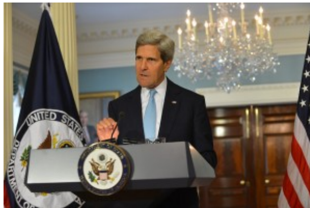
U.S. Secretary of State John Kerry on Aug. 30, 2013, claims to have proof that the Syrian government was responsible for a chemical weapons attack on Aug. 21, 2013, but that evidence failed to materialize or was later discredited.