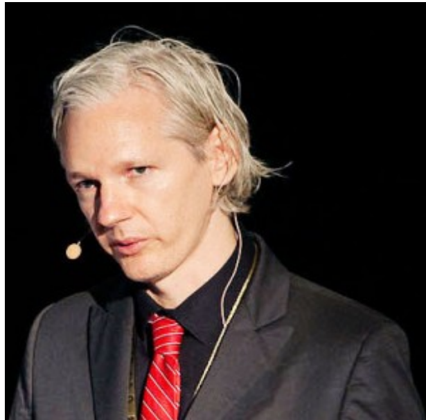
WikiLeaks founder Julian Assange at a media conference in Copenhagen, Denmark.

Mr. President, we do not know if CIA’s Marble Framework, or tools like it, played some kind of role in the campaign to blame Russia for hacking the DNC. Nor do we know how candid the denizens of CIA’s Digital Innovation Directorate have been with you and with Director Pompeo. These are areas that might profit from early White House review.