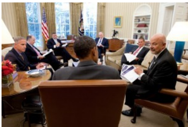
Director of National Intelligence James Clapper (right) talks with President Barack Obama in the Oval Office, with John Brennan and other national security aides present.

Key among the findings of the independent forensic investigations is the conclusion that the DNC data was copied onto a storage device at a speed that far exceeds an Internet capability for a remote hack . Of equal importance, the forensics show that the copying and doctoring were performed on the East coast of the U.S. Thus far, mainstream media have ignored the findings of these independent studies [see here and here ].