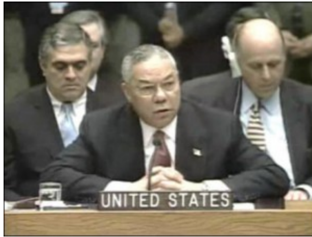
Secretary of State Colin Powell addressed the United Nations on Feb. 5, 2003, citing satellite photos which supposedly proved that Iraq had WMD, but the evidence proved bogus.

“The Russians” were the ideal culprit. And, after WikiLeaks editor Julian