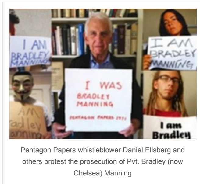
Pentagon Papers whistleblower Daniel Ellsberg and others protest the prosecution of Pvt. Bradley (now Chelsea) Manning

So, the gambit could not work. If it had been tried, enough people would have known the truth. They wouldn’t be fooled again and they would have alerted their fellow citizens. Bradley Manning had armed them with the facts.