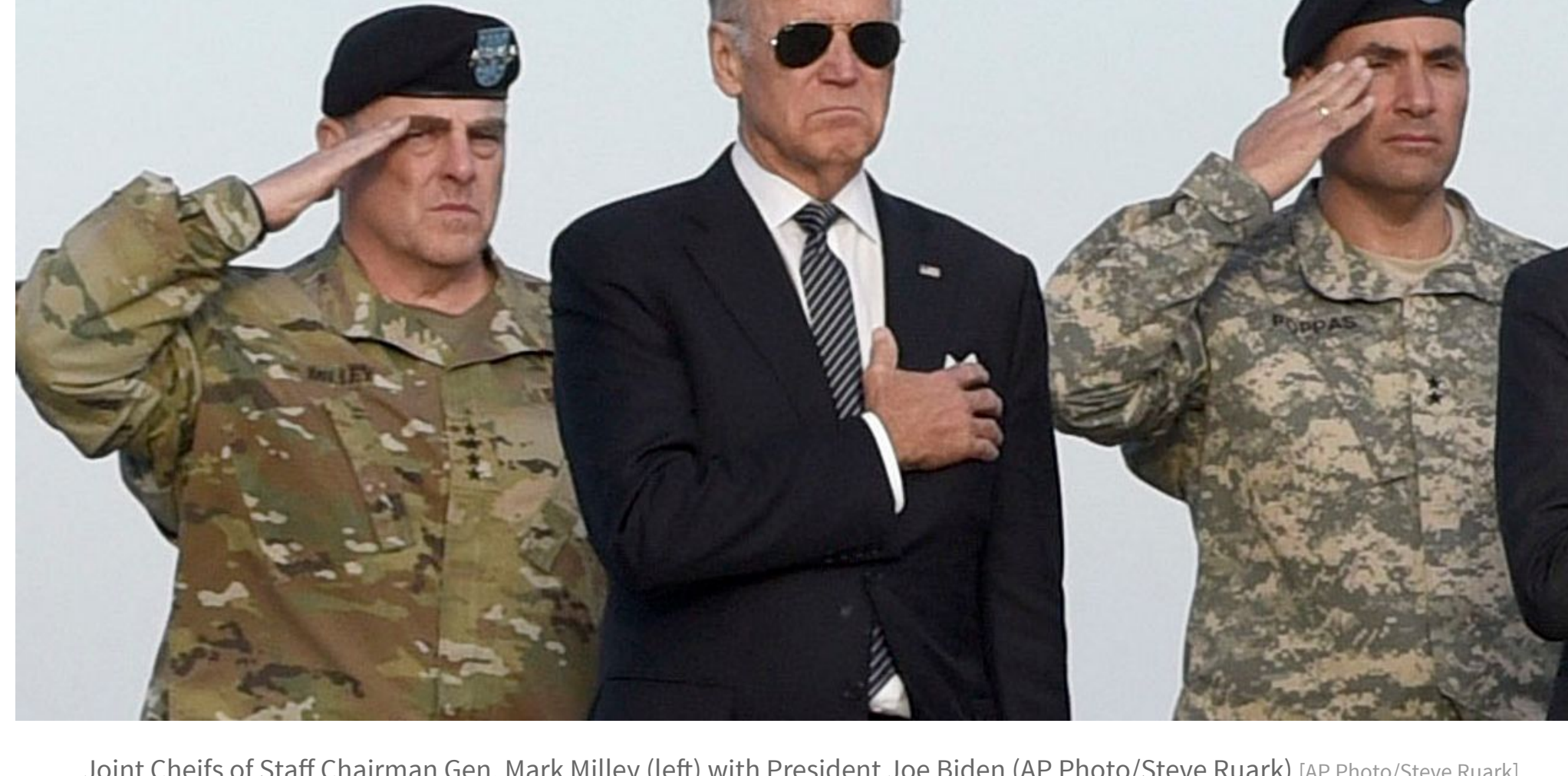
Joint Chiefs of Staff Chairman Gen. Mark Milley (left) with President Joe Biden

The print and broadcast media have told the public that the conflict is an “unprovoked war” and that “NATO is not involved.” Ukraine’s goals are “defensive.” There are no “American troops” in Ukraine. The next victory is just around the corner, if only the United States will send more money and advanced weapons.